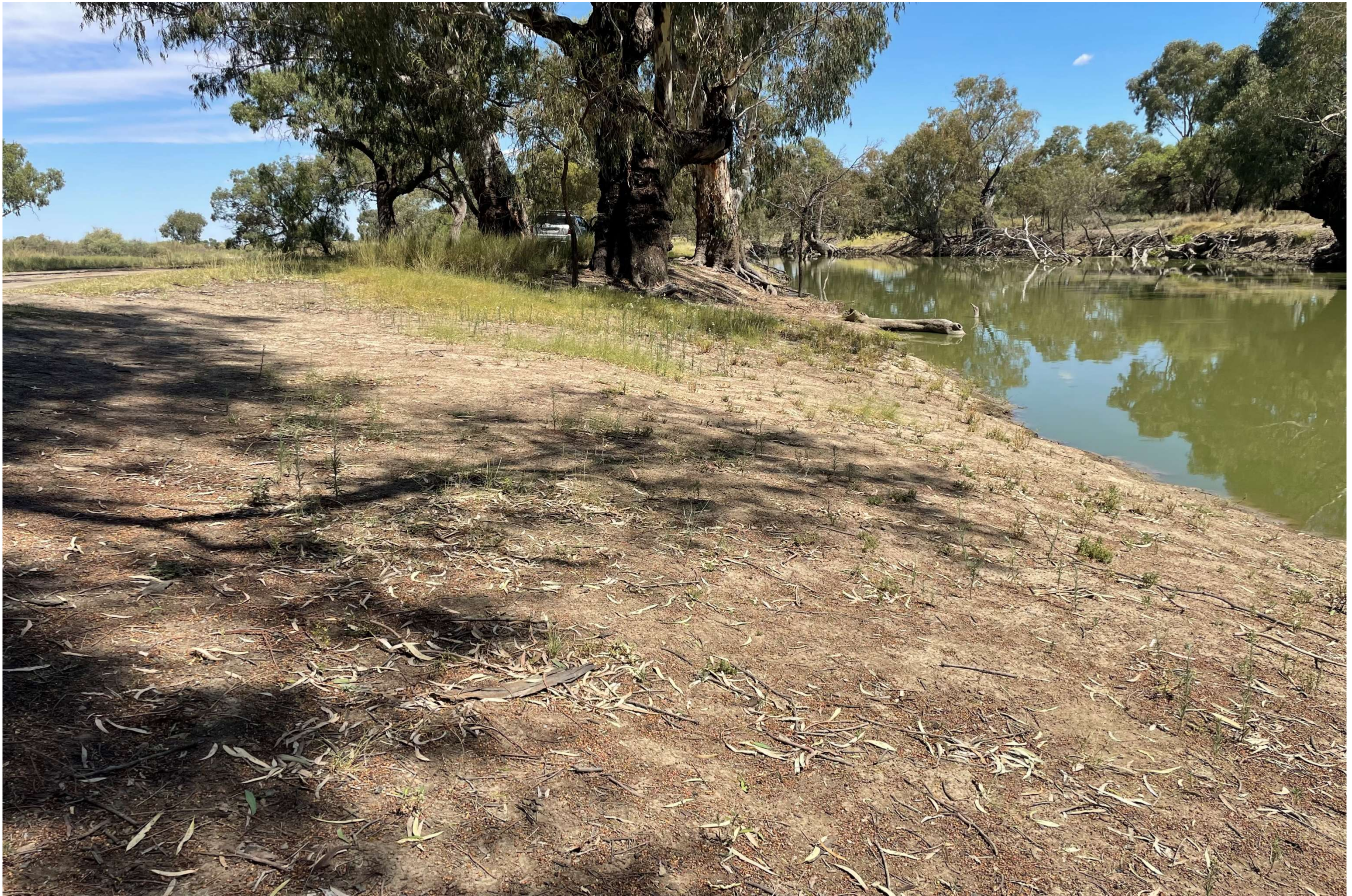
Photo 4. Riverbank section of the ramp location.