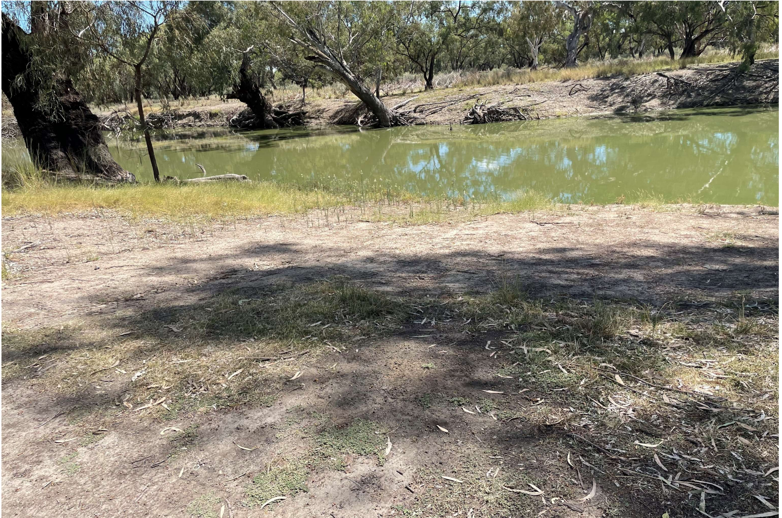
Photo 3. Lachlan River informal Boat ramp Area, Hillston North TSR