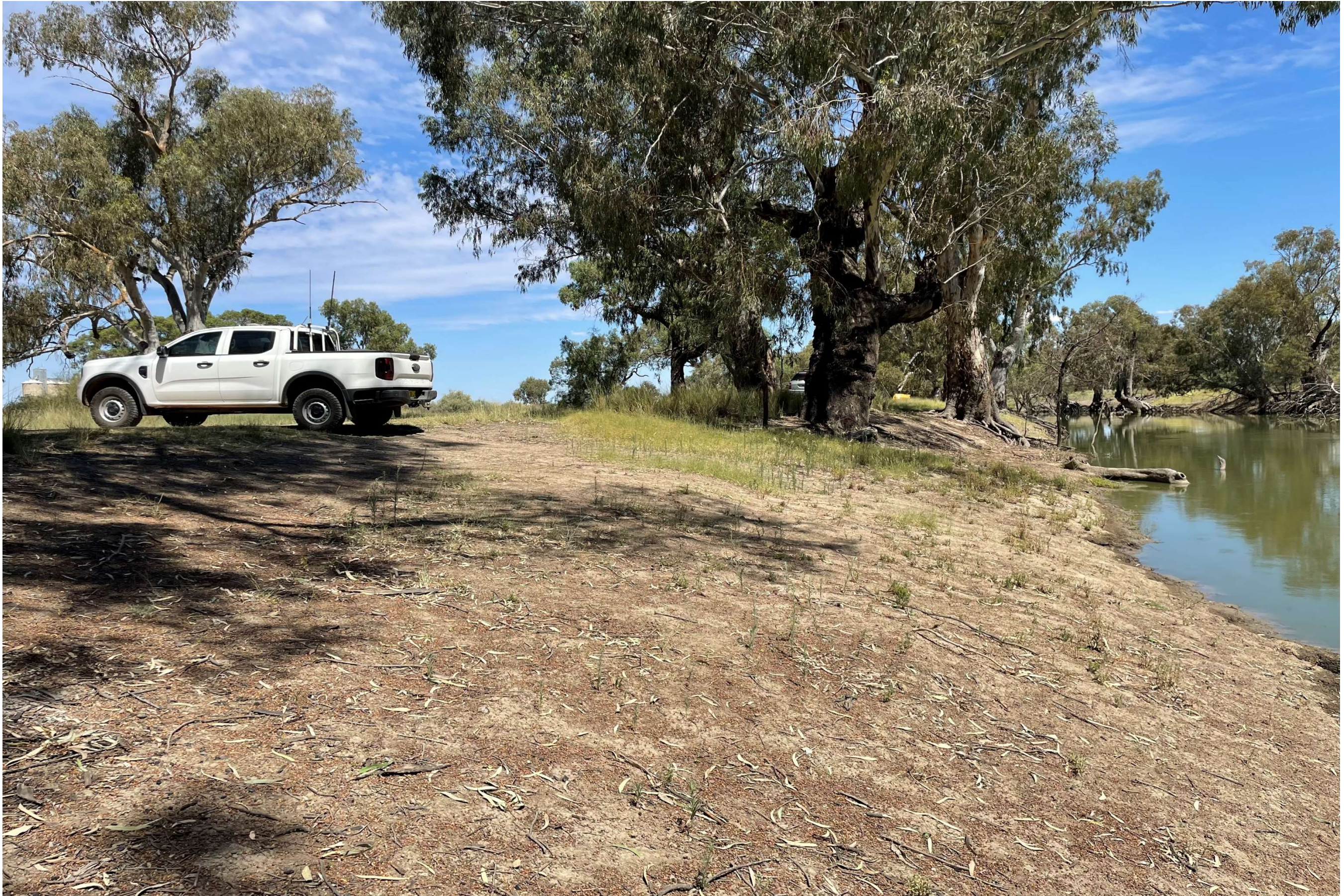
Photo 6. Grade currently at >20%, steeper than standard (12.5%) for constructed boat launching facilities.