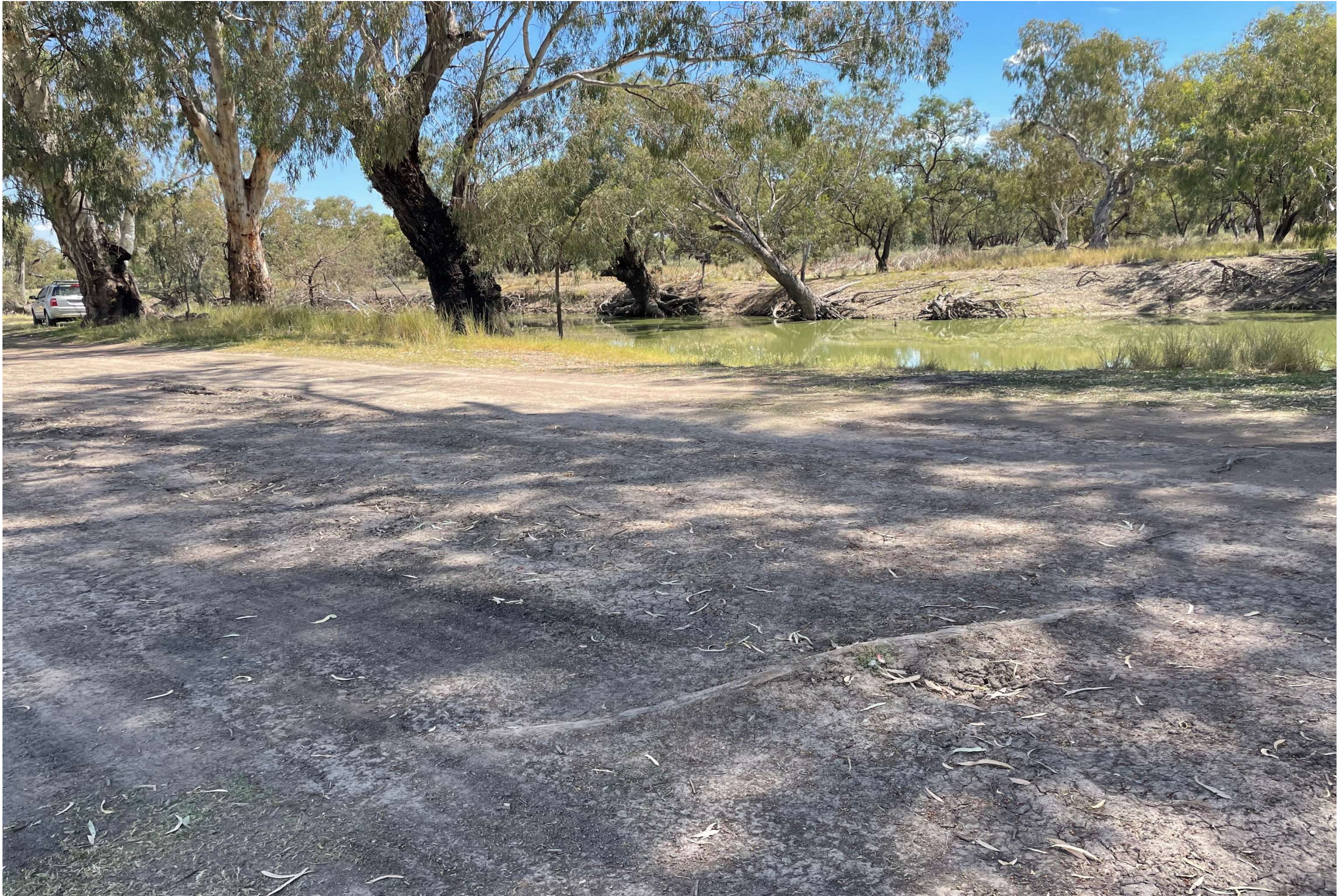
Photo 2. Locally used spot a lesser grade.