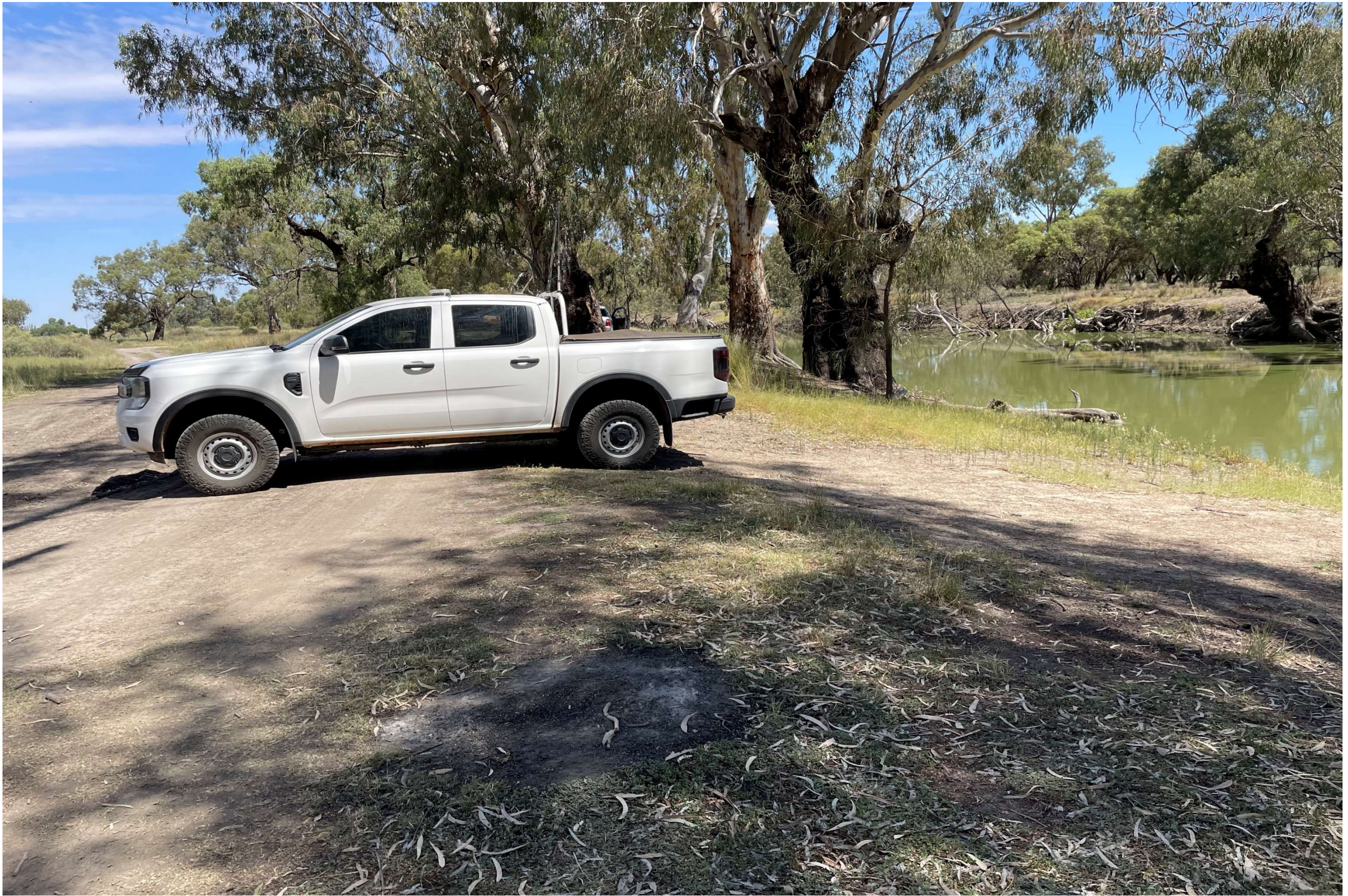
Photo 5. Vehicular approach to informal boat ramp.