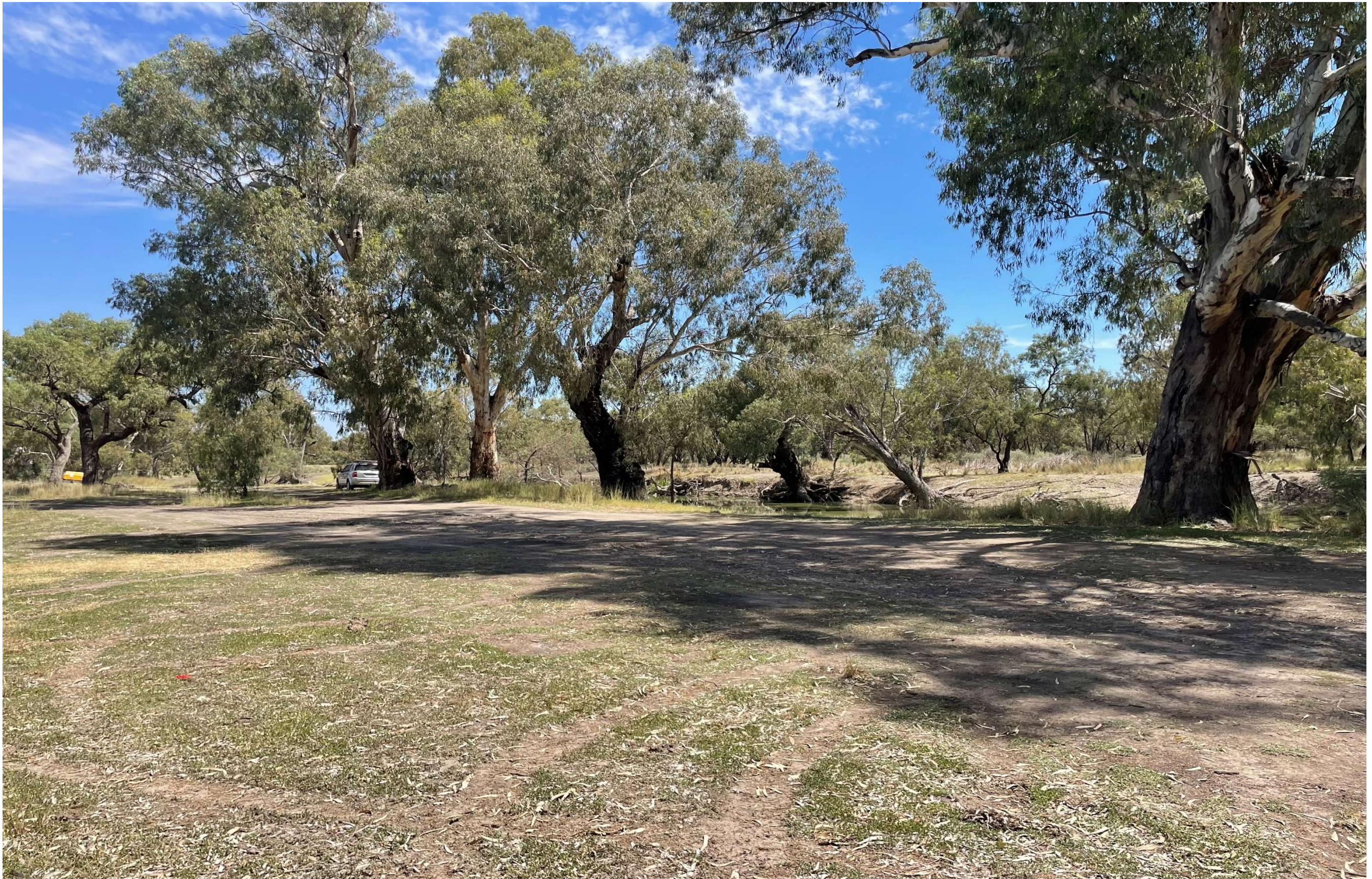
Photo 1. Boat Ramp Location well clear of established trees, in a prior disturbed area.